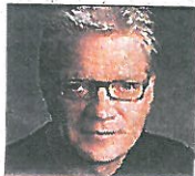
Sir Ken Robinson: "The quality of education is to do with the quality of teaching"

The difference, Sir Ken says, is great teaching. "The quality of education is so much to do with the quality of teaching," he said. "The quality of teaching is so much about having people who