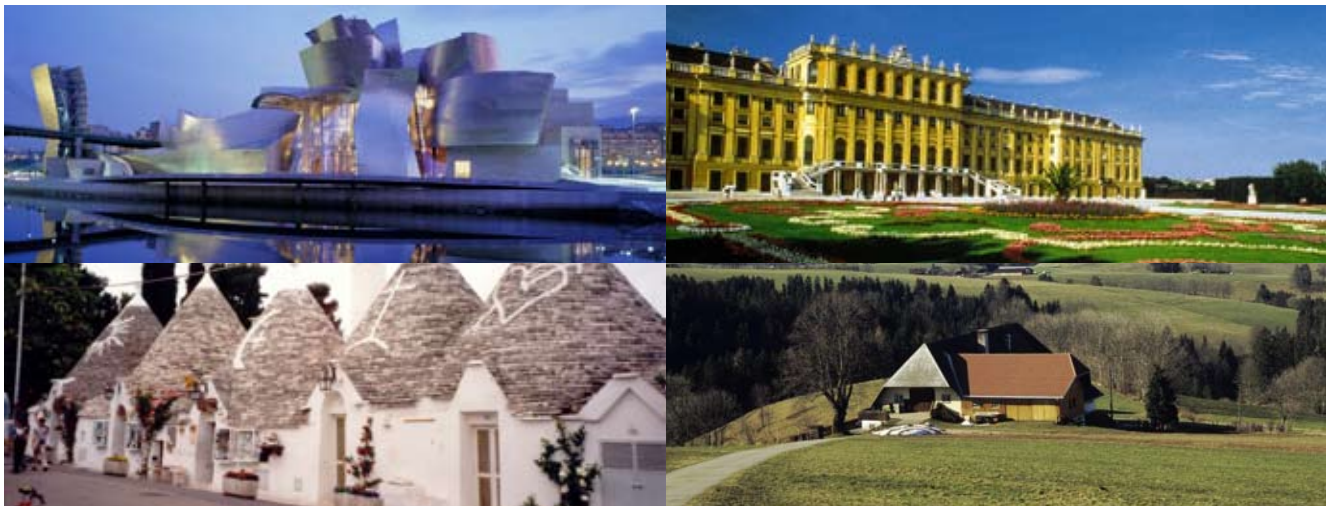
Example 6: Cultural competence is defined in the recommendations of the European parliament and commission as a recognition of the importance of the artistic expression of ideas, experiences and feelings in various artistic media. Knowledge, abilities, preservation of values and attitudes (such as respect and openness with regard to the diversity and cultural expression) are cited as components of cultural competence. These stretch from informed dealings with cultural heritage through openness towards the diversity of conflicting cultural practices in the present to visionary approaches that anticipate problematic and challenging positions in the future.

Another broad definition is the definition of culture used by UNESCO. It describes culture as “the whole complex of distinctive spiritual, material, intellectual and emotional features that characterise a society or social group” (including modes of life, value systems, religious and other beliefs and traditions). 11)