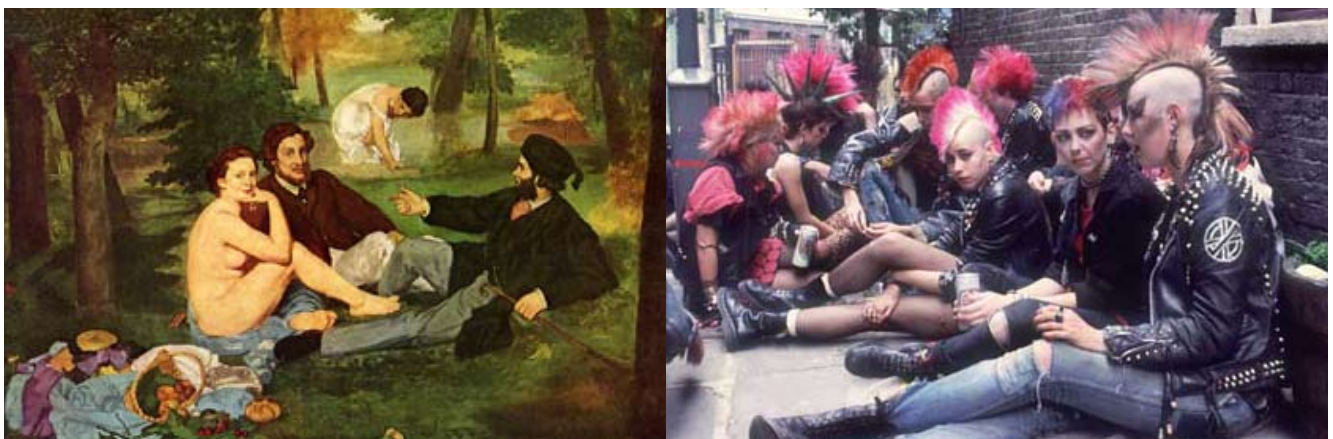
Example 7: Two societies from many... If we regard it as essential to the future that we succeed in making cultural diversity accessible to our children, then it will be important to learn something of ourselves and the world from the various perspectives, intellectual paradigms and inventive paths offered by art and culture in all its different forms.