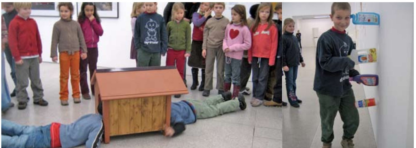
Example 3: Art education – educating through art. A primary school class examined the artworks in the exhibition “The artist who swallowed the world” by Erwin Wurm in the Museum of Modern Art in Vienna. In many different ways the exhibition offered the visitor an opportunity to explore the relationship of artist and viewer from different perspectives. Visitors themselves became active and contributed to producing the work.