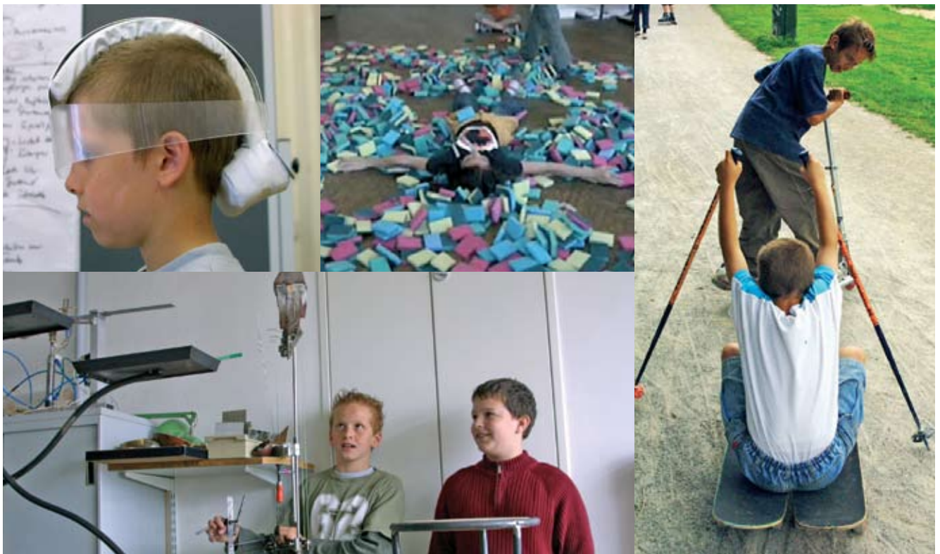
Example 4: design°mobil, an initiative of the Department of Design, Architecture and Environment for Art Education at the University of Applied Arts in Vienna supported by KulturKontakt Austria. During Designmobil processes the participants slip into the designer role. They test out various brainstorming and design strategies and learn to become acquainted with the design process as a creative strategy for action. Amongst the themes are an analysis of stale codes, ergonomics and useability, creating a market and human factors. Experiencing design processes serves to reflect on the status quo and sounding out possible design solutions. The goal of this activity is breaking with convention, re-thinking things and opening up new areas for action.

In this respect, adequate attention must be focussed on the multifaceted potential of young people, and conditions must be provided that allow this potential its full development. Unfortunately, up to now the promised paradigm shift has been reflected in the education system to only a very limited extent, or has been responded to merely with tightly structured “creative training” sessions.