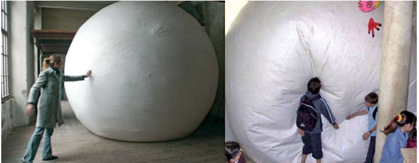
Example 2: textil:mobil was cooperative project that ran for a number of years between students of the Department of Textiles at the University of Applied Arts in Vienna, Austrian schools and a business. The goal was to promote a “material literacy” that was in the process of disappearing on the one hand and, on the other, to promote a learning culture that by using a sensual approach and joint artistic student work was intended to awaken curiosity, enjoyment and interest as well as leading to the formulation of relevant questions. These questions were explored and a number of works created that were spatially oriented and, above all, body oriented. They addressed issues related to the lives of young people, rendered their patterns of play and action visible, created references to their surroundings and tested new approaches.

A sensual approach lets children discover new worlds and come to grips with them in playful ways.