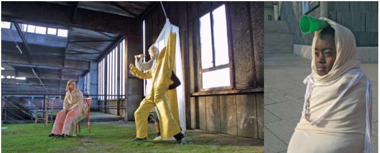
Example 1: School as a cultural centre. Staging curtain materials; developing possible roles inspired by fragments of costumes and space. Starting point: spontaneous theatre. Playful approach to variations in self-dramatisation. Examination and reflection on intentional and unintentional effects, experimentation with possibilities of social interaction. Interaction of different levels of the creative design process.

The function of schools in society is not only to give our children knowledge and skills, but to open up spheres of experience and development in which young people can get to know themselves and become familiar with the world, and which will comprehensively foster the development of their personalities.