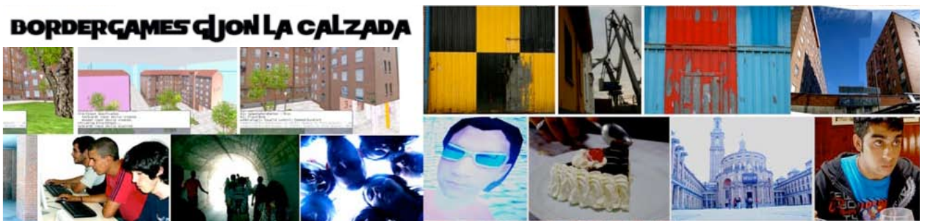
Example 12: Bordergames is a project to empower young migrants through the process of designing and programming a videogame fully made by them. Bordergames comprises a series of workshops, a videogame engine and an editor which allows young migrants not only to design a video game in which their experiences are the main element, but also to learn the importance of becoming familiar with new technologies and using them to self-organise and recover control over their own lives and environments. www.bordergames.org Spain

It is when resources become scanty and insecurity grows, when a lack of opportunities allows no visions of the future, that borders are closed up tight and there is a tendency to retreat behind hardened constructions of what is one's own and what is alien. Idealisations and demonisations are frequent side effects of this process. Deviations from what is familiar engender rejection and aggression, or are penalised with marginalisation. Discussions about identity and culture then often serve the purpose of justifying separation and exclusion. Cultural education programmes cannot work miracles, but they can introduce new perspectives, make restrictive views and actions perceptible, and challenge people to make a move – however small. In this sense they open up negotiation spaces, promote active debate and thus help to develop a conflict culture. (This can be compared to the work strategies of the Japan Foundation in the field of peacemaking.)