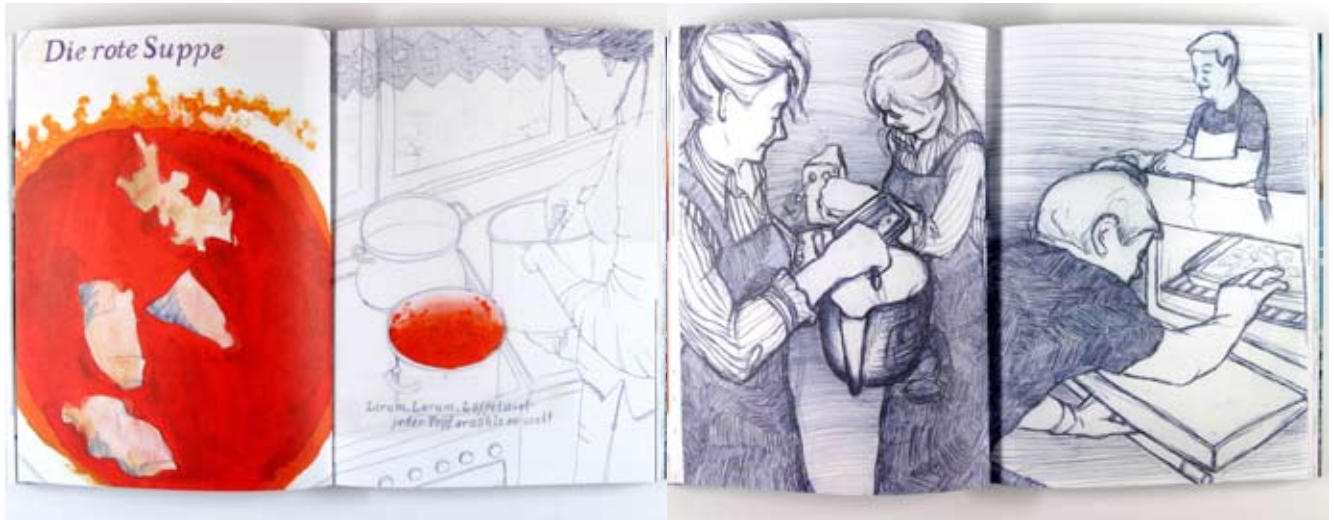
Example 13: “Here we only cook with love”. The illustrated “cookbook” is a document produced by a cooperative effort between art and art education students and the tenants of a high-rise complex on the outskirts of Vienna – a social hot spot with a high level of latent violence. Initial encounters in which cooking and eating together represented the central element of familial life led to stories about cooking and life that sketched an impressive portrait of the tenants and their worlds. By working jointly on the book, areas were opened up which the tenants had previously reacted to with disinterest or rejection, shyness or fear.

The use of new technologies can develop these projects considerably further and open up entirely new dimensions for communication and negotiation.