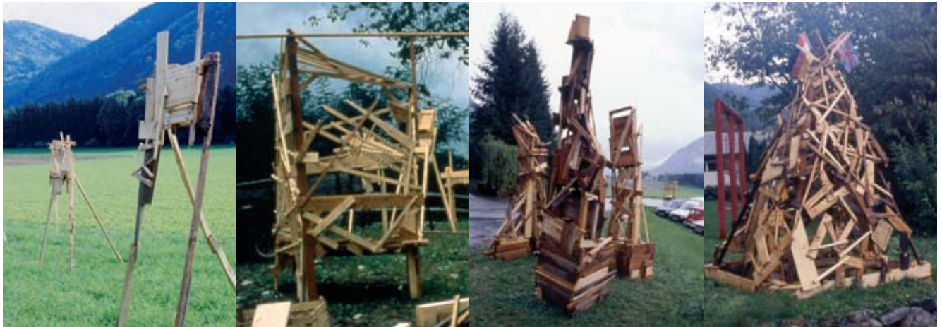
Example 11: „treffen“. What happens when artistic working methods are infiltrated into a system that has nothing to do with art? The example given here presents a series of works made during a week-long project in a care centre for people with special needs. It documents the intensive work processes of a group of men who were personally unable to make themselves verbally understood but who, over the course of a week, developed a series of wooden sculptures that formulated their individual and group needs and communicated them to the system. The works dealt with the issues of increased privacy, communication with the outside world, the ambivalence between control and overview and the desire for self-administered rooms for meetings.

Our openness for learning processes of this kind is continually being challenged.